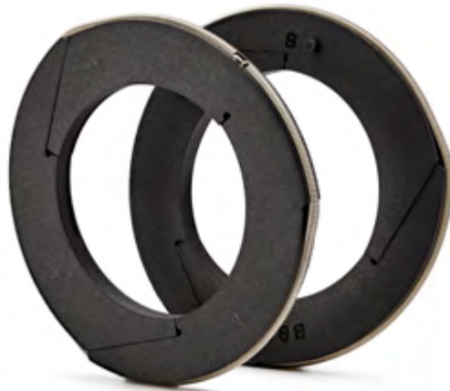
TruTech P1150 material provides proven rod packing performance under reduced lubrication rates

For example, applying an optimized lubrication strategy with TruTech P1150 sealing components on an average size natural gas reciprocating compressor has generated lubrication consumption savings of $9.63 per day, or $2,100 per year. This can easily translate to $500,000 to $1,000,000 in annual savings for a large fleet of compressors.