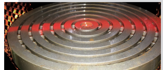
Optical comparators confirm precise flatness of lapped components